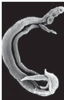
Male and female flatworms